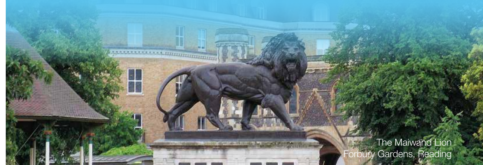
The Maiwand Lion Forbury Gardens, Reading

For further details & to register go to www.mededevents.net/RSU or email us on course2016@readingshoulderunit.com or Telephone UK +07741482224